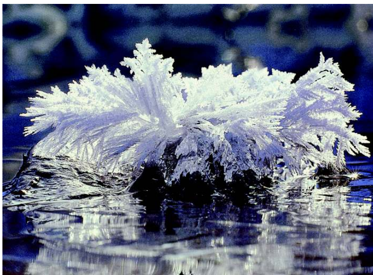
The crystalline world of water in ever changing new forms, carries in its natural state of perfection the vital pattern for our health—physically and spiritually.

histamine, salt is a strong natural anti-histamine. It prevents cramps. The structure of bones depends on salt for fullness, because 27 percent of the salt reserve in the body is in crystallized form in the actual bone structure, in the shaft of the bone. And low salt diets actually cause osteoporosis, not calcium deficiency.